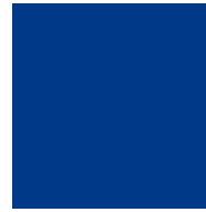
3M 3630-137 European Blue